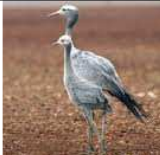
SA's National Bird – the Blue Crane